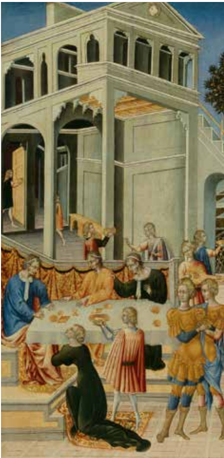
Salome Asking Herod for the Head of Saint John the Baptist (1455-60)

La decollazione di San Giovanni Battista