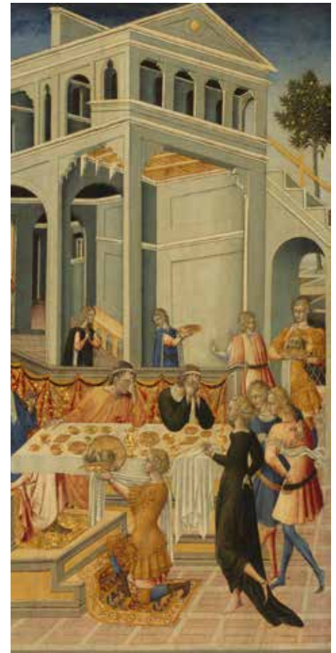
The Head of Saint John the Baptist Brought Before Herod (1455-60)