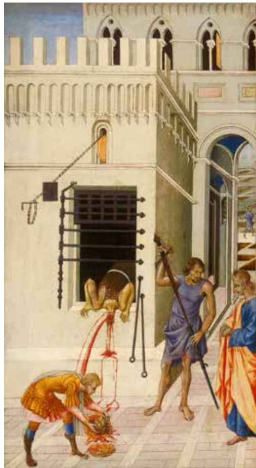
The Beheading of Saint John the Baptist (1455-60)

La decollazione di San Giovanni Battista