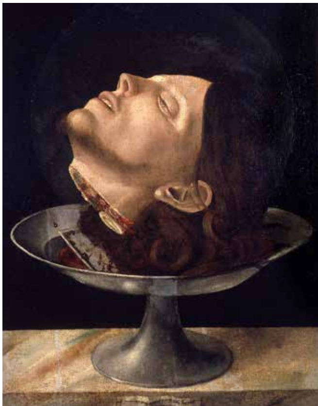
The Head of Saint John the Baptist by Giovanni Francesco Maineri (1502)