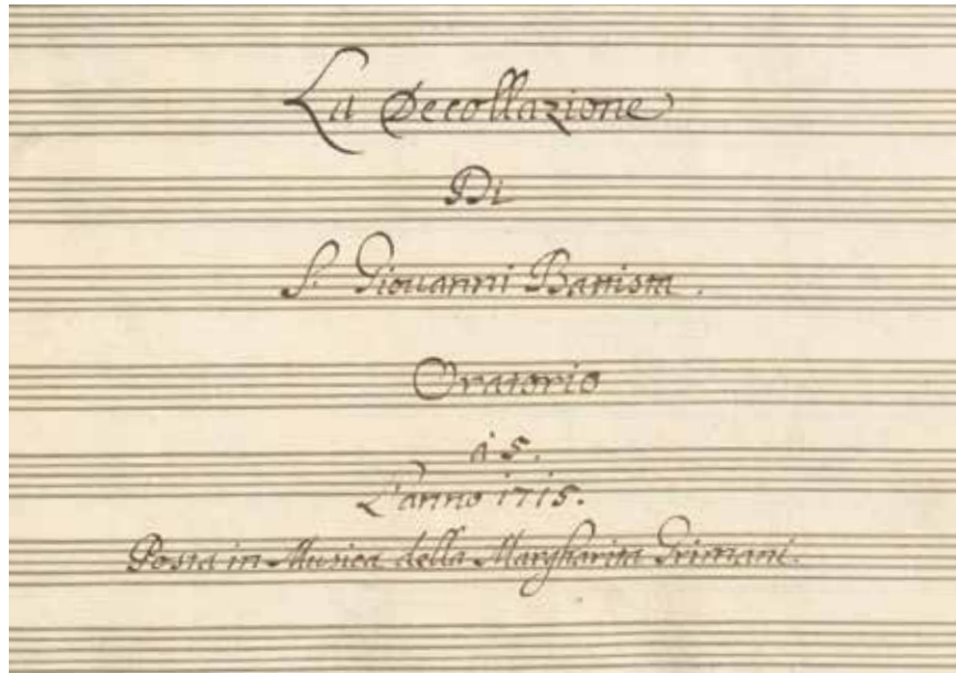
Manuscript of La decollazione di San Giovanni Battista