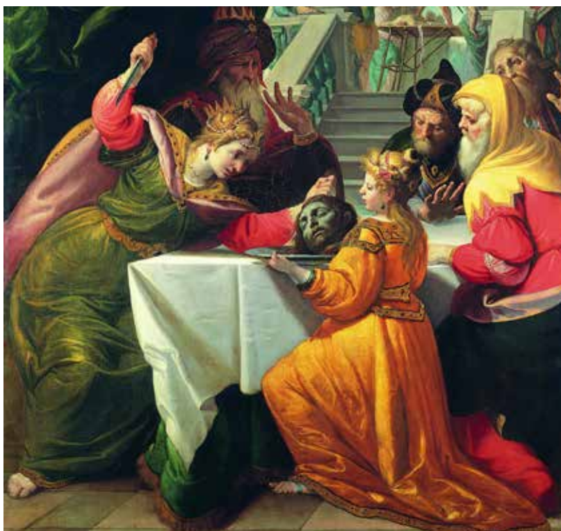
Herodias presented with the Head of the Baptist by Salome by Andrea Ansaldo (1630)

He bargained for over a decade to ensure the women in his family could inherit the Habsburg dominions undivided. Thus, in 1715, when Grimani composed La decollazione , the Viennese would have been attentive to the idea of women's power in court.