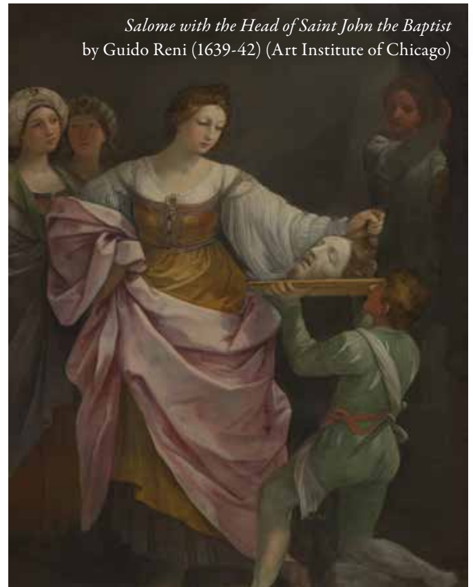
Salome with the Head of Saint John the Baptist by Guido Reni (1639-42) (Art Institute of Chicago)

Below is another example of the beheading of Saint John the Baptist from the Art Institute of Chicago's collection. All artworks completed by the artist Giovanni di Paolo.