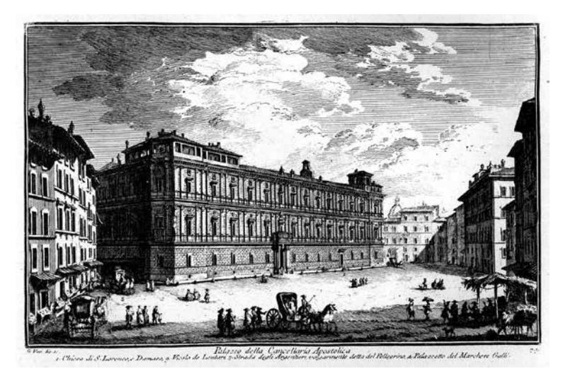
Palazzo della Cancelleria, 18th-century engraving by Giuseppe Vasi